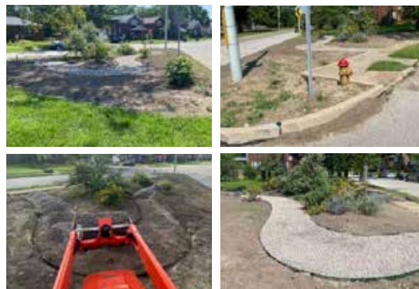
WELLINGTON AND MIDLAND

Although it's not done yet, we invite you next to Wellington and Midland where we are expanding another garden bed to include a path and a place to sit. This lovely space has been maintained and generously watered for years by the surrounding neighbors. With the help of the city, we were able to have irrigation installed so they will no longer have to use the spigots on their homes. This allowed us to triple the size of the garden and begin developing it as a showcase and destination for the neighborhood. Come see the progress. We can't wait to celebrate its completion next year where it will be highlighted for our garden tour in the lovely Musick Neighborhood.