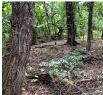
Another area cleared of invasives. Virginia creeper, a native vine, covers some ground in the middle of the photo.