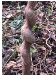
This photo was taken in March & shows the damaging effects of Japanese honeysuckle vine.

Several weeks ago, we completed the first phase of the project! Yay! We have made one complete pass along the Nature Trail from McKnight to the Golf Course, over 1/2 mile. We have cleared hundreds of trees from the damaging effects of these invasive vines and opened up views through the woods considerably.