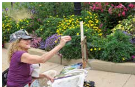
DELMAR AND TRINITY

Autumn, with its crisp, clear air and golden, slanted light, is a perfect time for plein air artists to prop their easels up outdoors and capture the moment. U City in Bloom will hold its Plein Air Festival and Competition again this fall. Artists will be painting from September 1 through the day of the event, October 9. You may see them at work throughout