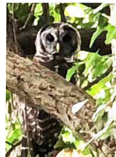
This brown eyed beauty (a juvenile Barred Owl) has watched us work in the woods all of his life. Several NatureScapers have seen him or her and we have all heard him and his parents calling to each other. This little barred owl should have an easier time finding food. It is hard for an owl to see a mouse moving underneath deep layers of Wintercreeper. Trust me, I have lost several tools this way.

So, what are we working on now? We have started again from the McKnight entrance and are venturing further from the trail, removing any vines that have grown back or that we missed on the first pass. We are also removing the vines from the ground at least 12 inches from each tree trunk to prepare for mowing and spraying the invasive ground cover later in the year. We are removing more Bush honeysuckle ( Lonicera mackii ) now, too, by cutting it to the ground and treating the stumps with roundup, a satisfying change from removing vines.