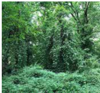
Out of control invasive vines in one area of the woods.