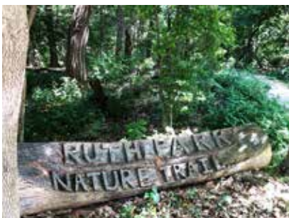
RUTH PARK WOODS

Finish your tour in the Ruth Park Woods .