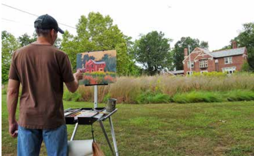
THE GREEN CENTER

On Sunday October 9, there will be a reception and showing of the artists' works at The Green Center, (8025 Blackberry Ave.) from 5 – 7 PM. Tickets for the reception will be available for $20 and may be purchased at the tent on the east lawn of City Hall (6801 Delmar) from 8 – 12 noon. You may also pay at the door at 5 PM. Admission includes drinks and light refreshments from some of University City's finest restaurants and best home cooks. Meet the artists, visit with your neighbors, and have the opportunity to purchase a lovely work of art to take home.