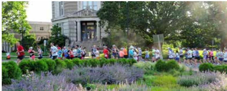
Runners at the start of the 5 and 10 K events pass UCB's plantings in the roundabout

It was a beautiful day for the 48th annual University City Memorial Day Run, a fundraiser for UCB, the Green Center, and the University City Public Library. Some racers have run this race for decades and now have grandkids in the Fun Run. We thank our generous sponsors, the UCHS ROTC Color Guard, the scores of community volunteers who got up early on Memorial Day to make it happen, and the nearly 1100 runners who participated.